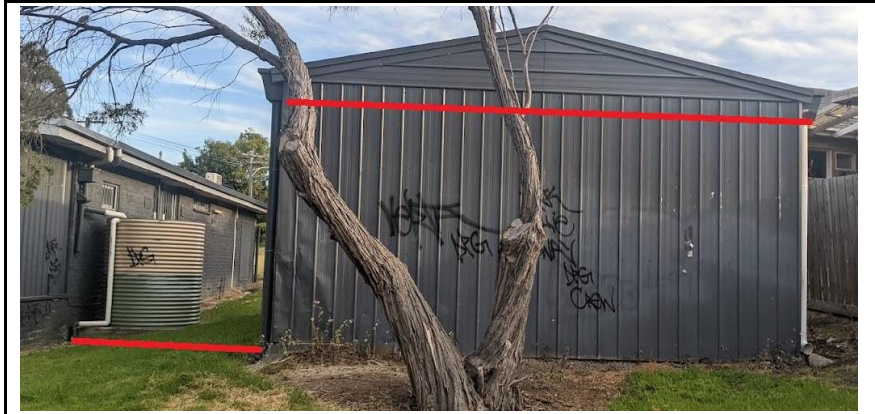
Both to be worked on in the coming month.

I have also been in contact with The Diversity and Inclusion Patrol Leader Dylan, about having an Acknowledge of Country plaque at VRC from: